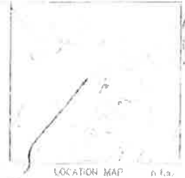
LOCATION MAP n.1a.

SITE ANALYSIS ACRES= 0.31 13,500 Sq.Ft.± RE-ZONING R-2 TO M-1 PROJECT CONTACT PERSON: JODY SHEA 1522 DUGDALE ST. Chattanooga Tn 37405 (423) 987-1896